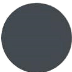
Duplicate RR23 Dark Grey