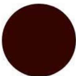
RR887 Chocolate Brown